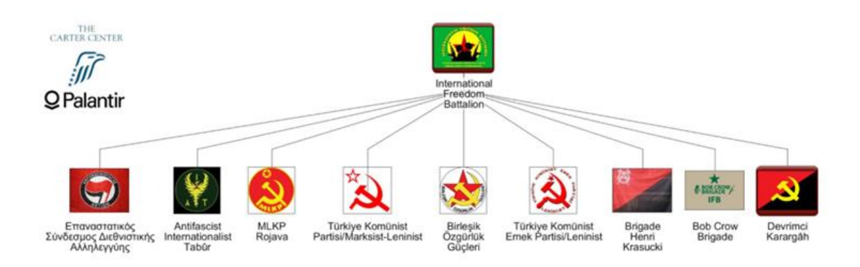
Figure 2: Chart of IFB subunits in northern Syria (The Carter Center, 2017, p.2)

The International Freedom Battalion (IFB) is the largest leftist group of non-Syrian communists, anarchists, socialists and revolutionaries fighting ISIS under the aegis of the YPG. The IFB, inspired by the International Brigades that were set up during the Spanish Civil War in the second half of the 1930s, was established in Northern Syria in June 2015. An umbrella organization, the IFB consists of several Turkish and Western leftist groups, Figure 2 (The Carter Center, 2017, p. 2).